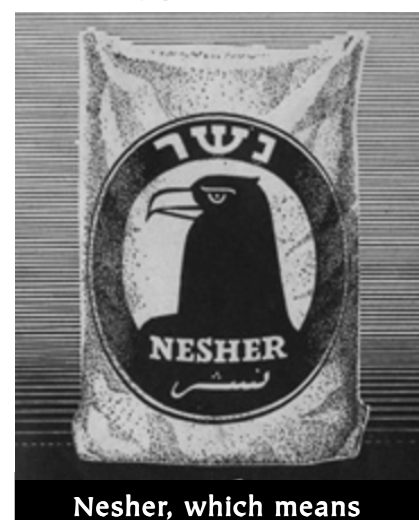
"vulture" in Hebrew, is often mistranslated as "eagle." It also means "windfall."

Cement Roadstone Holdings www.caiaweb.org/tfp/CRH.html