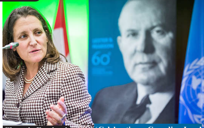
Chrystia Freeland Celebrating a Canadian Icon