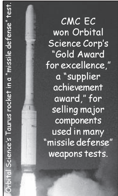
Orbital Science's Taurus rocket in a "missile defense" test.

7500 Innovation Way Mason OH 45040-9699 Phone: (513) 573-6100 Fax: (513) 573-6767 Email: blampe@cmccinci.com Website: www.cmccinci.com