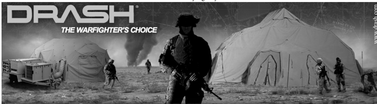
DHS Technologies' Deployable Rapid Assembly Shelter (DRASH) is used by Israel's armed forces.

This Israeli company provides high-performance computer networking technologies to the US Army, Navy, Air Force, FBI, Department of Homeland Security "and various intelligence agencies." It also sells to the world's leading war industries, including the top five: Lockheed Martin (#1), Boeing (#2), Northrop Grumman (#3), Raytheon (#4) and General Dynamics (#5).