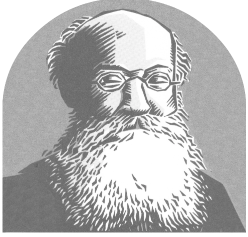
In 1909, this exiled Russian scientist, atheist and anarcho-communist reported on the Csarist imperial regime's brutal repression of strikes and mass protests.

Kropotkin also cited official data on 221,000 Czarist prisoners, and estimated that 50,000 to 100,000 others were being held in local "police lock-ups." The crackdown also created more than 700,000