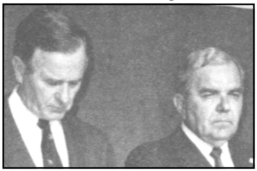
During his 1988 presidential campaign, George Bush Sr. (like Nixon and others before him), used a Republican network lead by right-wing, East European émigrés, including Nazi-collaborators. Bush is seen here at a July 20, 1988, banquet (co-sponsored by the pro-Nazi Anti-Bolshevik Bloc of Nations) with Bohdan Fedorak, of the Ukrainian Nationalists - Bandera that organized military units to massacre Ukrainian Jews in WWII.

The émigré fascist network organizes support for its ideological