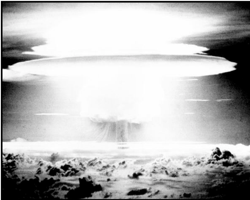
“Castle Bravo,” a 15-megaton hydrogen bomb explosion on March 1, 1954, was the world’s largest atmospheric test. Fallout from this blast contaminating hundreds of people on the Marshall Islands. The fallout also hit 23 Japanese fishermen on a ship called the “Lucky Dragon,” as well as US servicemen who were monitoring the test.

Source: Mondial , April 2002. Published by the World Federalist.